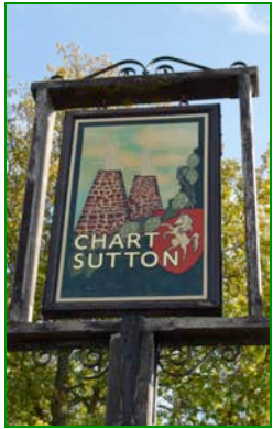
Chart Sutton is, with Sutton Valence and East Sutton, one of the 'Three Suttons'. The parish is situated some three miles southeast of Maidstone on the edge of the Greensand Ridge, overlooking the Weald. It is a sparsely-populated rural parish of some 885 hectares with an electoral roll of about 700.

Chart is the modern word for the Saxon 'Caert' meaning heathland. The Saxon King Coenwulf gave a charter to the parish in AD814. The area was on the route used by the North Kent tribes when they took their stock south to fatten on the rich forest lands. A settlement around a church provided shelter and rest for the travellers, but no trace remains.